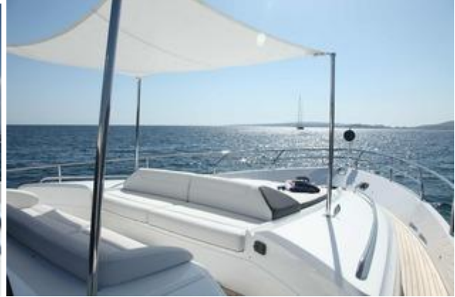
Sunbathing at bow (view 2)