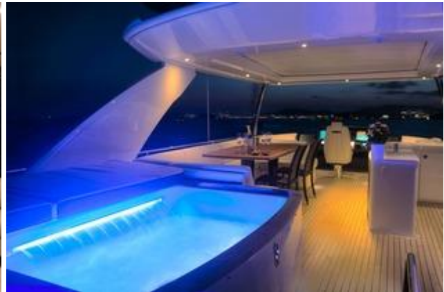
Jacuzzi on flybridge