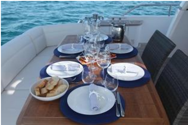
Aft dining (view 2)