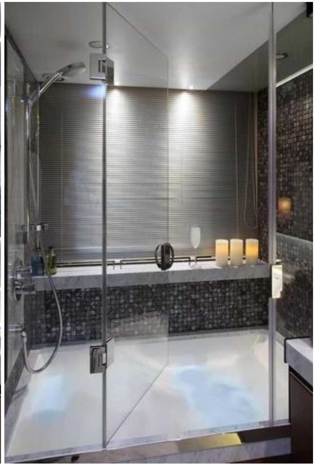
Master Bath (closeup)