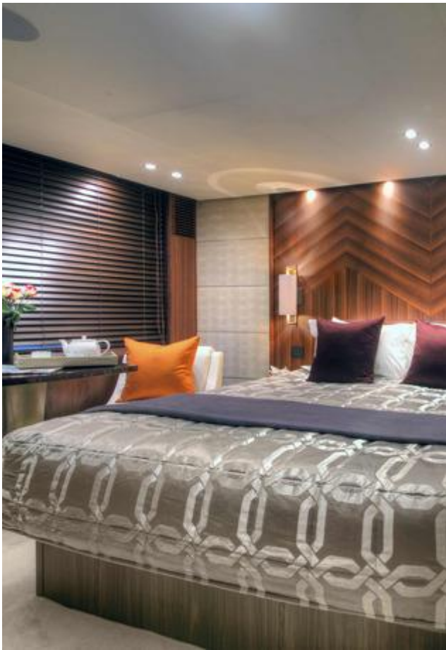
Master Cabin (L)