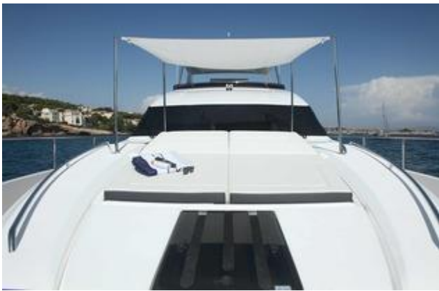
Sunbathing at bow