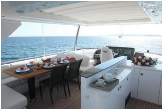
Flybridge (with shade)