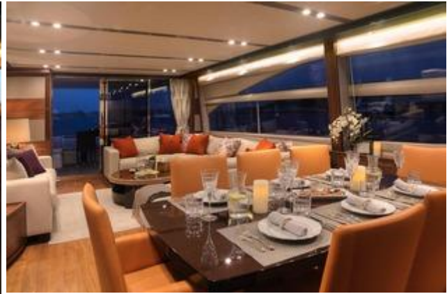
Saloon (view 2)