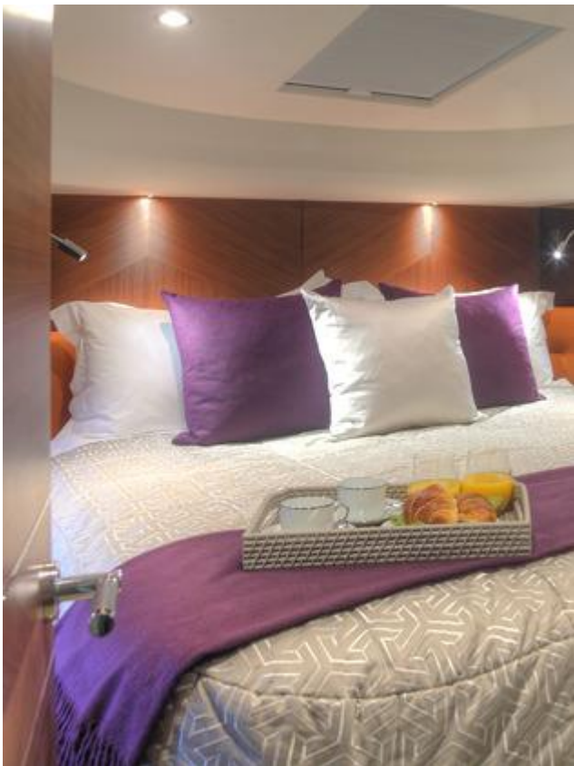
VIP Cabin (L)