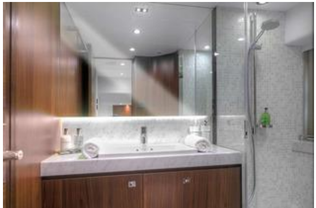
Double Cabin Bath