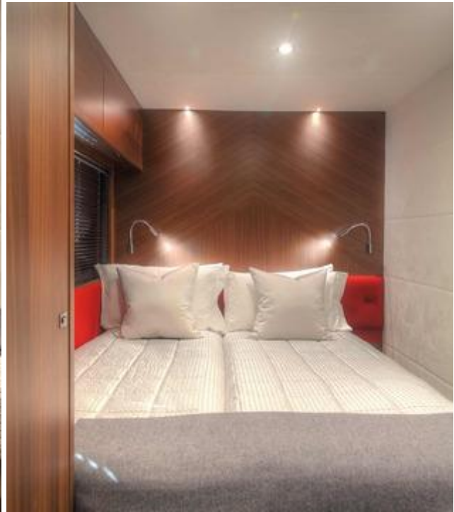
Twin Cabin Converted to Double