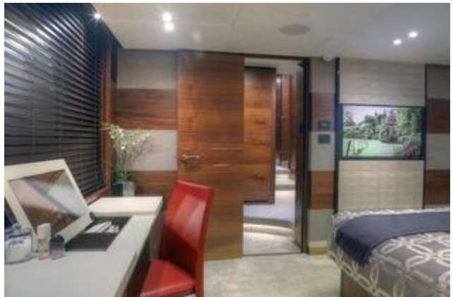
Master Cabin (view 3)