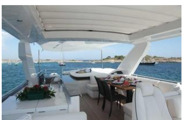
Flybridge (view 2)