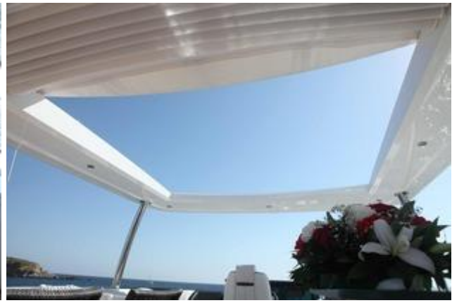
Flybridge (with top open)