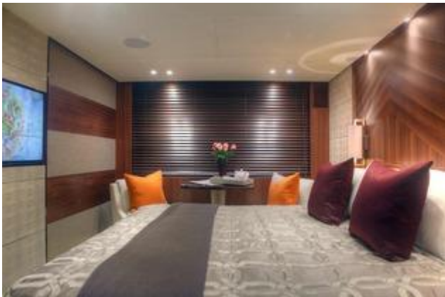
Master Cabin (view 2)