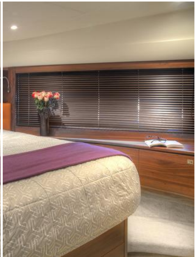
VIP Cabin (R)